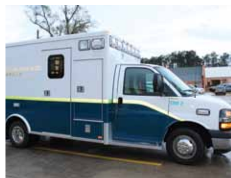
West Feliciana Parish Hospital EMS ambulance

This is reached with proven medical director involvement in all matters that affect patient care, from protocol development to vehicle equipment, education programs, training, quality improvement and response time standards.